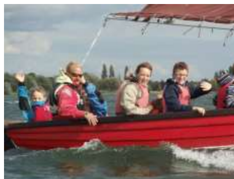
Year 4 Residential Trip

opportunity to take part in a residential trip every year.