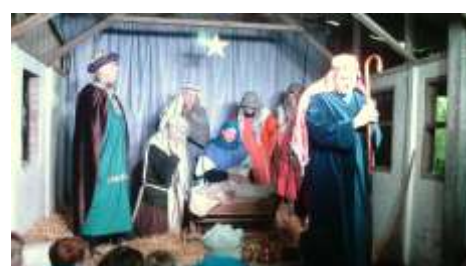
Year 2 Live Barn Nativity Visit