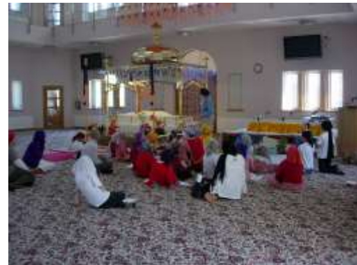
Faith Tour to Queens Park

After consultation with the Head Teacher, parents have the right to withdraw their children from this subject if they wish.