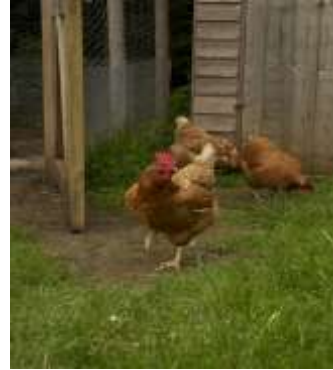
Look at our chickens!

school garden and care for our chickens. Parents are asked to complete a consent form agreeing to their children helping to care for the chickens.