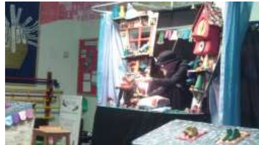
"Theatre of Widdershins" School Visit

We ask you to read, sign and discuss the home/school agreement with your child and return a copy to school.